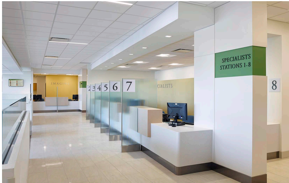
View of the registration area

Not only is wayfinding important upon entrance, it's also important for exiting. HCM designed the building with single corridors that all funnel back toward the waiting room. One whole wall of the waiting room is made of glass so when a patient exits a pod, they can follow the natural light from the waiting room back towards the door. The incorporation of daylight into the design offers an inherent wayfinding tool that doesn't require excessive signage in the hallways leading to the exit.