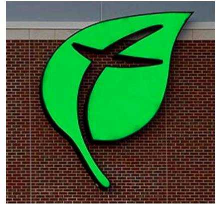
Mercy's signature leaf

In recent years, Mercy had replaced and rebranded their main site and wanted the new hub in Glen Burnie, MD, the first to be built after the rebrand, to follow the same model and standards. To accomplish this, HCM began with the exterior of the facility. The building, formally a grocery store, was surrounded by a large parking lot. While positive in terms of accessibility and capacity, it presented a branding challenge. To ensure recognition of the Mercy brand from the farthest reaches of the parking lot and from the street, HCM redesigned the front façade to match that of the main Mercy hospital in brick and panel color, and added an entrance canopy with the Mercy leaf.